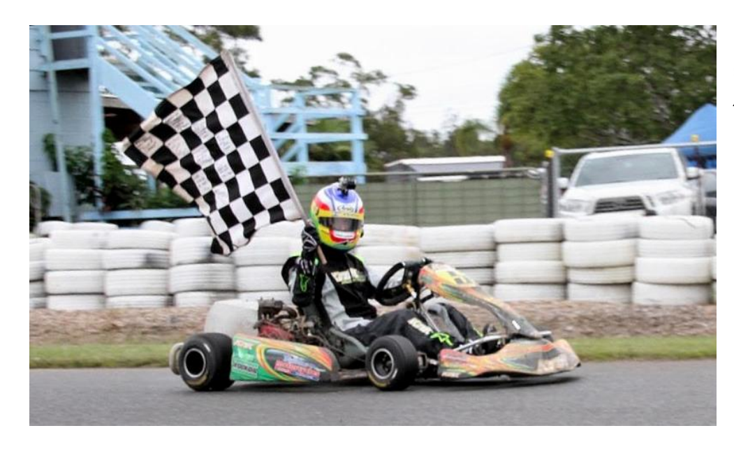
Victory Lap Kart #5 Team KnK Australia.