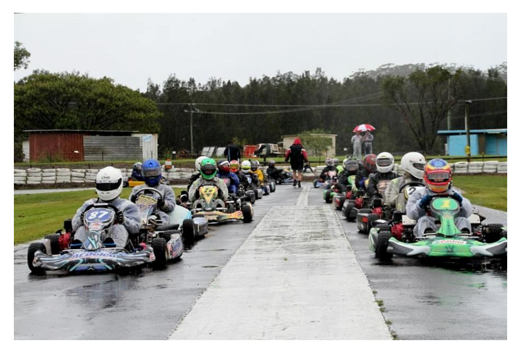
The grid comprising around 24 drivers